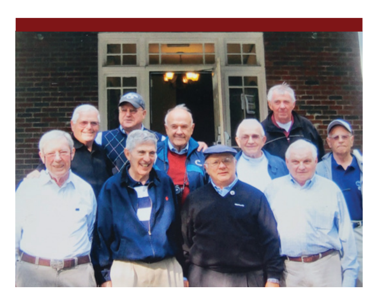
2014 Phi Lamda Class of '57-'59 Reunion